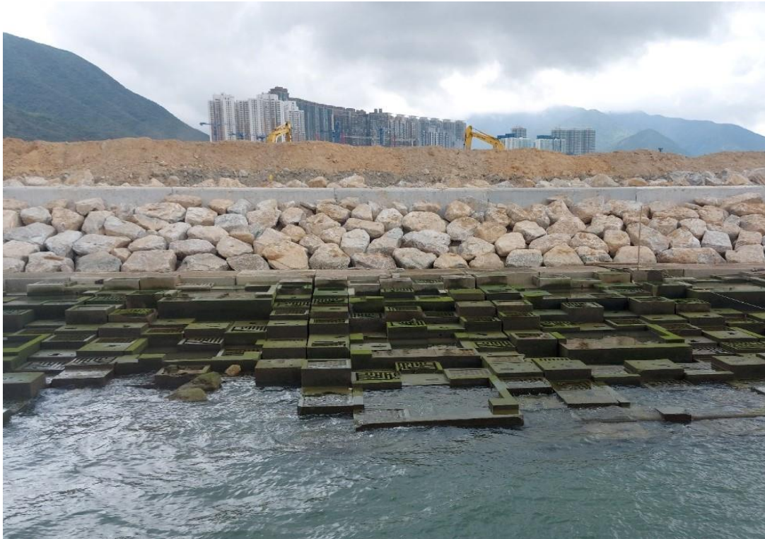
Photo 4 - Natural Rock Material/Planting for Artificial Seawall