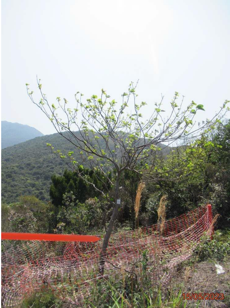
Photo 1 - Tree protection zone for preserved plant species of conservation importance